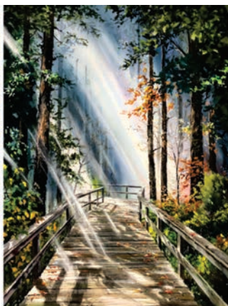
Bog Garden at Benjamin Park